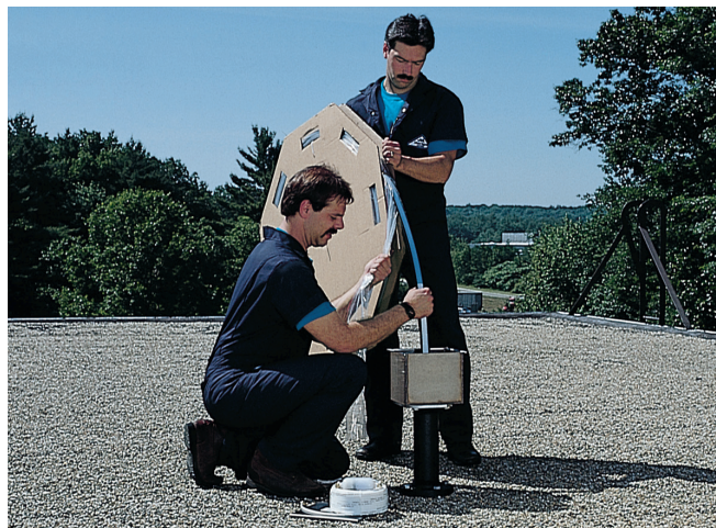
Flexible resistance-tape sensors are easily installed from tank top

These level gauges are easily installed from tank top by dispensing the flexible sensor from its reel into a customer supplied still pipe of PVC or steel. For some non-agitated tanks, a specially weighted sensor can be used without a stillpipe.