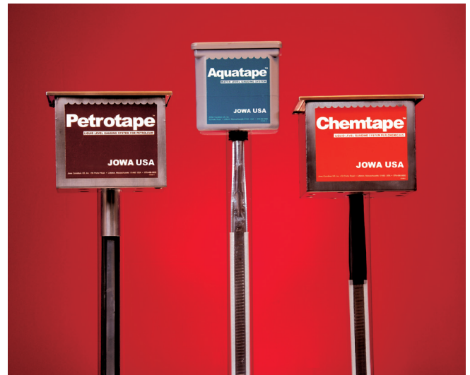
Aquatape™, Petrotape™, and Chemtape™ level gauges

The helix winding is gold plated nichrome, 4 turns/inch, 1000 ohms/meter (305 ohms/ft.) resistance gradient and provides 1/4" resolution.