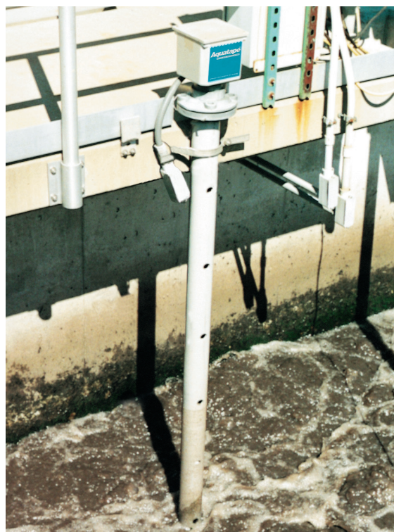
Resistance-tape level sensors are unaffected by agitation or foam