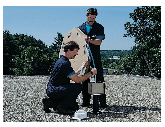
Flexible resistance-tape sensors are easily installed from tank top

These level gauges are easily installed from tank top by dispensing the flexible sensor from its reel into a customer supplied still pipe of PVC or steel. For some non-agitated tanks, a specially weighted sensor can be used without a stillpipe.