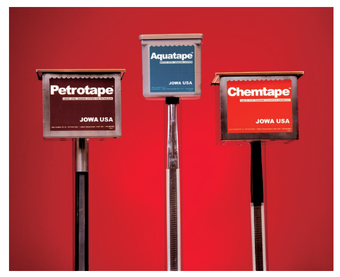
Aquatape™, Petrotape™, and Chemtape™ level gauges

The helix winding is gold plated nichrome, 4 turns/inch, 1000 ohms/meter (305 ohms/ft.) resistance gradient and provides 1/4" resolution.