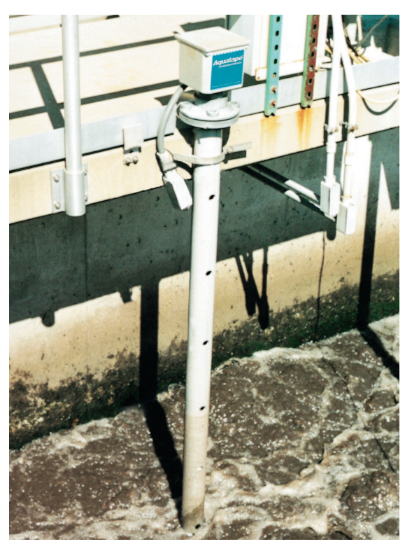
Resistance-tape level sensors are unaffected by agitation or foam