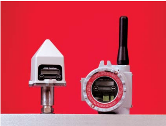
Wireless model WRT & WBR allow for quick and easy installations

The FCC license-free WRT allows for level monitoring in places that were previously thought