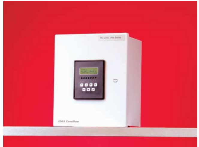
Multi-Channel Monitoring System MC-2200 Series