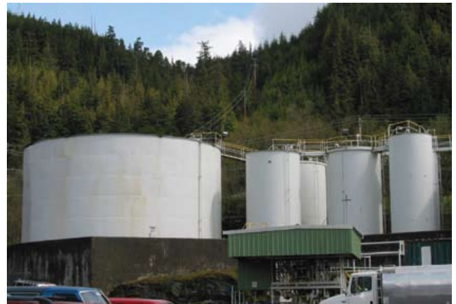
Fuel Storage Tanks with Wireless Level and Temperature Monitoring

The systems are easy to install and the tank does not need to be drained or taken out of service as sensors are installed from the top. If you don't already have wire or power at the tank the wireless level system is the most cost effective method to monitor your tanks. A battery powered field unit mounted on top of your tank transmits level or temperature to a base radio.