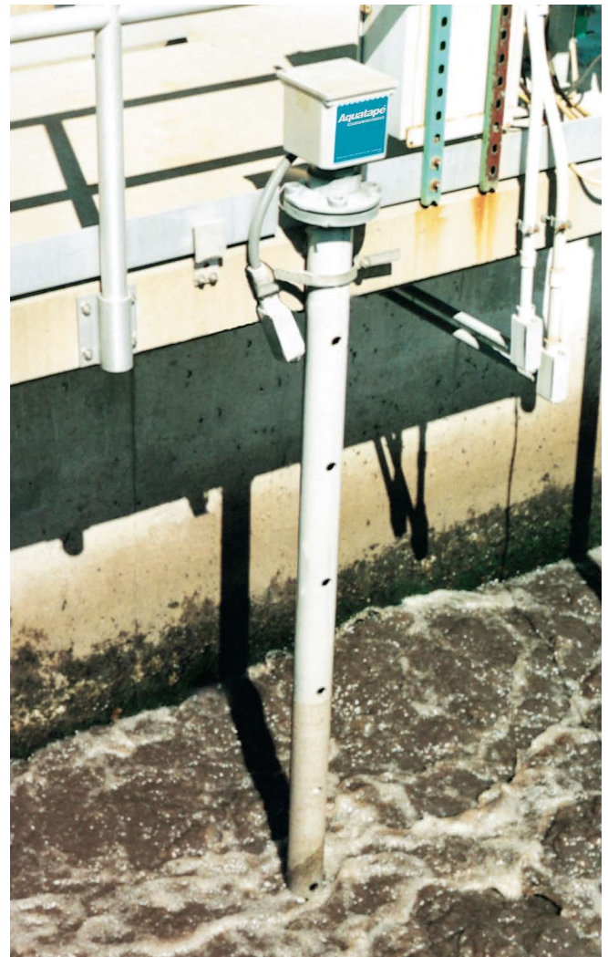
Resistance-tape level sensors are unaffected by agitation or foam

cost prohibitive due to the expense of running wire or adding a power source. The FM approved intrinsically safe field unit is suitable for installation in hazardous areas without the use of IS barriers. The power is derived from a 3.6V lithium battery that lasts 3 to 5 years with update rates as fast as once per second. The maximum line of sight range is 3,000 feet or 500 to 1000 feet for applications with obstructions.