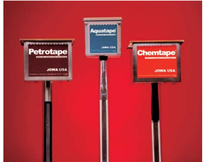
Aquatape™, Petrotape™, and Chemtape™ level gauges

The helix winding is gold plated nichrome, 4 turns/inch, 1000 ohms/meter (305 ohms/ft.) resistance gradient and provides 1/4" resolution.