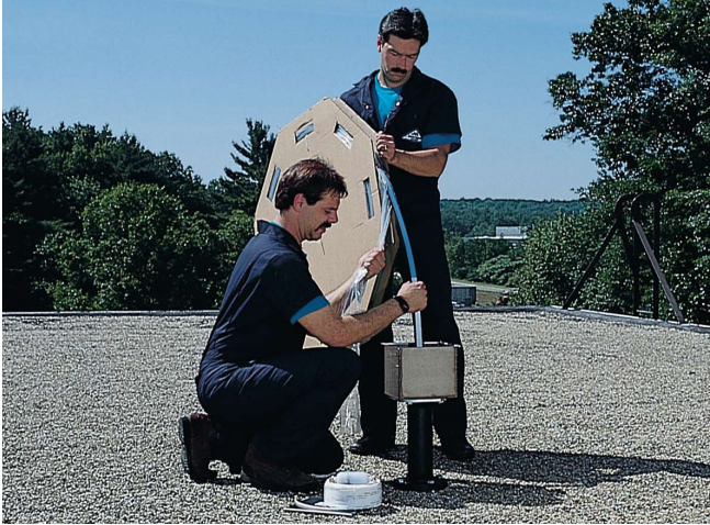
Flexible resistance-tape sensors are easily installed from tank top

These level gauges are easily installed from tank top by dispensing the flexible sensor from its reel into a customer supplied still pipe of PVC or steel. For some non-agitated tanks, a specially weighted sensor can be used without a stillpipe.