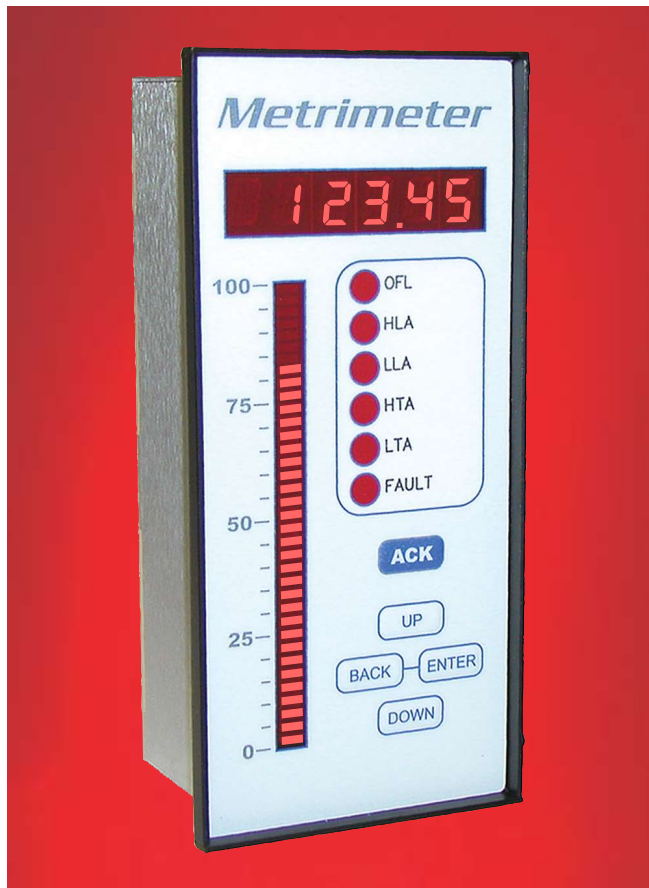
Metrimeter Single Tank Monitoring System