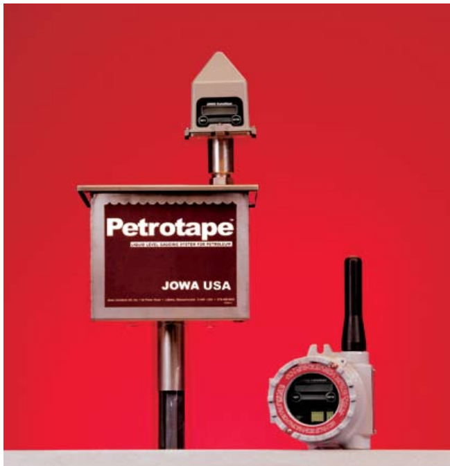
Wireless Level System for monitoring Petroleum Products

Access remote sites via computer with a modem or the internet and avoid unnecessary travel.